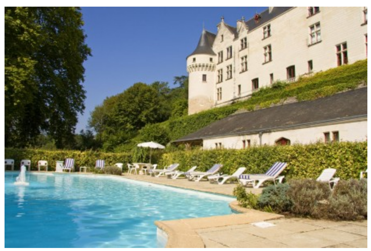
Day 6 Chateau de Chambord/Chateau de Chenonceau/Wine Tasting [B D]

Today visit Chateau de Chambord, crown jewel and emblem of the Renaissance. Originally a weekend hunting lodge for King Francois I in the 16th century, the Chateau evolved into the most expensive (and excessive) architectural project by a king. Continue to Chateau de Chenonceau, 2nd most visited chateau, adjacent to the beautiful River Cher. Enjoy a delicious wine tasting at magnificent Caves du Pere Auguste winery. Return to our hotel. Dinner included at the hotel.